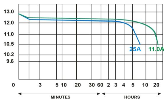
Loading Voltage vs Discharge Time