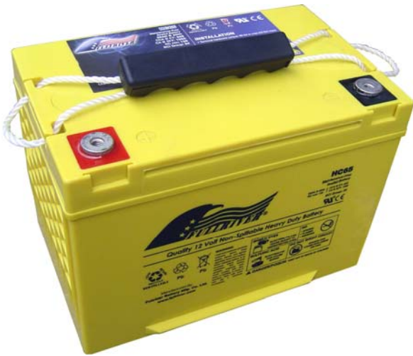
Battery Model: HC65/B Battery Terminal: M8 (Button terminal)