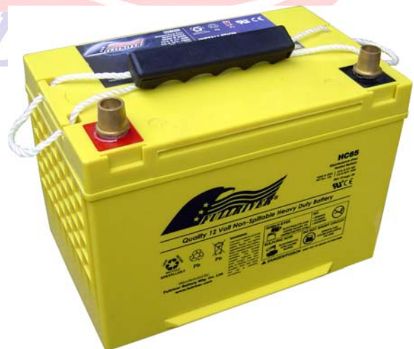
Battery Model: HC65/T Battery Terminal: T (M8 Button terminal fitted with TP28 brass automotive terminal)