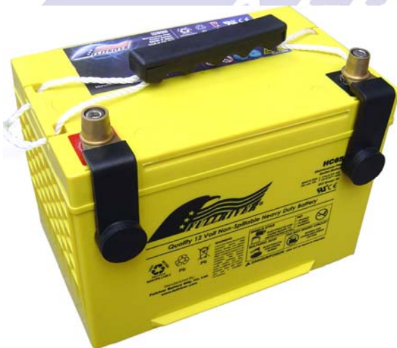
Battery Model: HC65/ST Battery Terminal: ST (M8 Button terminal fitted with TP28 brass automotive terminal and Side terminal)