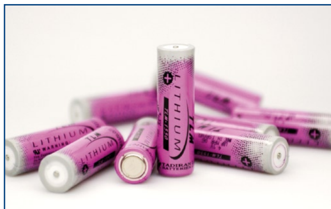
TLM High Power Batteries