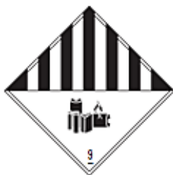
Lithium Battery Class 9 Hazard Label Figure 1