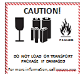
Lithium Battery Label Figure 4

Shipper must complete phone number portion of label.