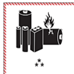
Lithium Battery Mark Figure 3